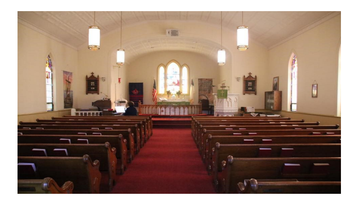
Marshall Lutheran Church