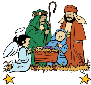
God Bless Us Everyone

Riley the Rectangle was introduced this month along with the color brown, G,H,I and the numbers 7 and 8. We made monster puppets and played imagination door. The kids wanted dinosaurs, princesses riding unicorns, cats and Cocomelon to be behind the door! We would like to wish everyone a very Merry Christmas and Happy New Year!