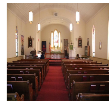
Submitted by, Dawn Kiefer