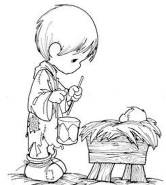
"Pa Rum Pa Pa Pum"